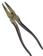
10in Utica Style RoundNose Fence Pliers $23.24 - $14.61 Save: 37% off